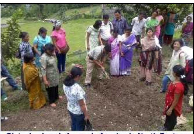
Biotechnology led organic farming in North Eastern Region DBT, GOI- Demonstration