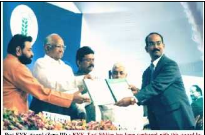
Best KVK Award (Zone III): KVK, East Sikkim has been conferred with this award by ICAR in the 6th National Conference of KVKs held during 3-5 December, 2011 at JNKVV.